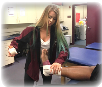
ROP Sports Medicine