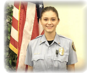
ROP Law Enforcement Careers